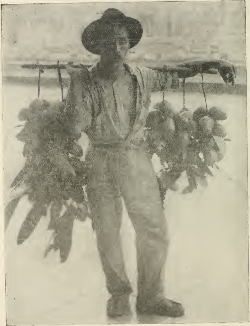
VENDOR OF MANGOS, GUANAJAY. THE FRUITS ARE SEEDLINGS OF THE MANGO RACE.